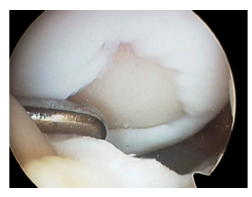
Figure 1 Full thickness articular cartilage lesion on the femoral condyle of the knee, exposing the subchondral bone plate

The OATS procedure is currently the only procedure that restores the normal hyaline articular cartilage to the injured knee. Microfracture and