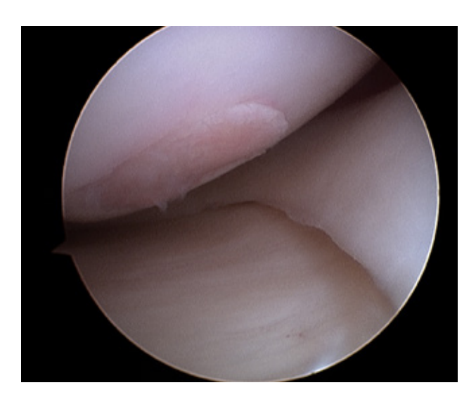
Figure 4 A large single plug press fit into a hole created at the site of the lesion

restrictions and precautions are given to protect healing tissues and the surgical repair/reconstruction. General time frames are also given for reference to the average, but individual patients will progress at different rates depending on the size and location of the chondral lesion, their age, associated injuries, preinjury health status, and rehabilitation compliance. Specific attention must be given to impairments that caused the initial problem. For example if the patient is status post medial compartment OATS procedure and they have a varus alignment, post-operative rehabilitation should include correcting muscle imbalances or postures that create medial compartment stress.